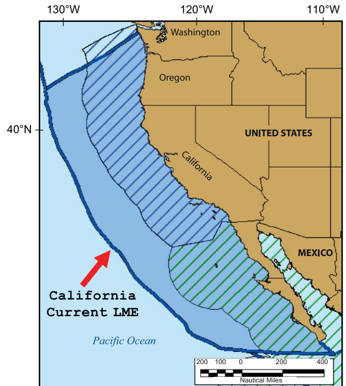
Fig. 1. Map of the project’s geographic scope, the California Current LME. The solid line in the Pacific Ocean represents the boundary of the California Current LME. The blue hatching is the Exclusive Economic Zone (EEZ) of the United States, and the green hatching is the EEZ of Mexico. (Spatial data provided by University of Rhode Island for the LME boundary, the US National Oceanic and Atmospheric Administration Coastal Services Center for the US EEZ, and the Marine Conservation Biology Institute for the Mexico EEZ.)

The second criterion was that the laws be limited to national and state levels relevant to the geographic scope. Additional levels of management certainly exist within the geographic scope, such as county, regional, and city, but due to time constraints, it was not feasible to comprehensively identify and gather laws from hundreds of smaller-scale jurisdictions.